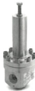
RS(H)10, 15, 20